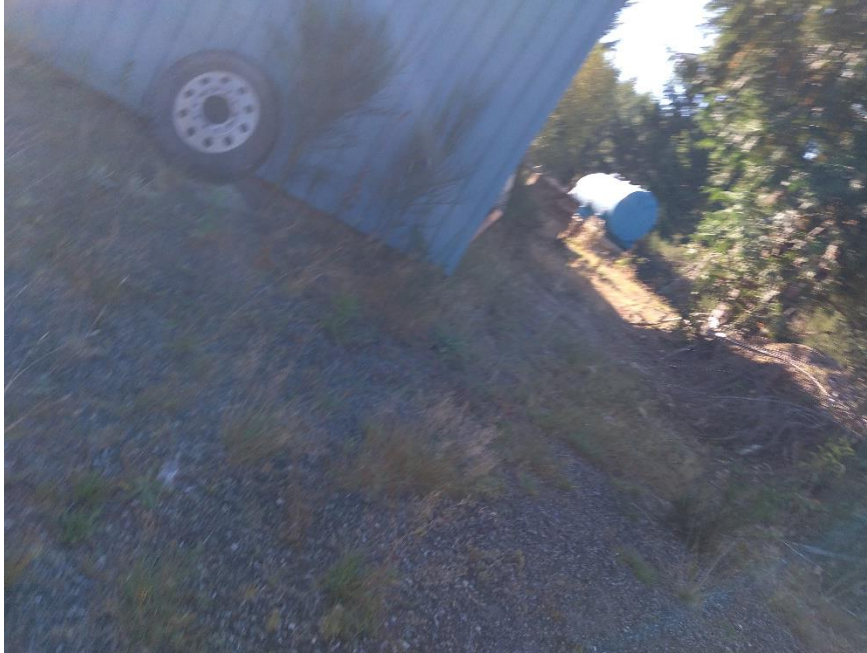
Figure 8 Photo showing water tank for fire suppression