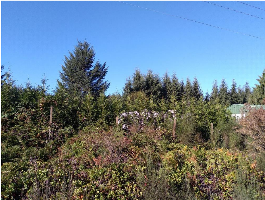
Figure 9 Showing visual screening (cedar hedge), photo taken from the road