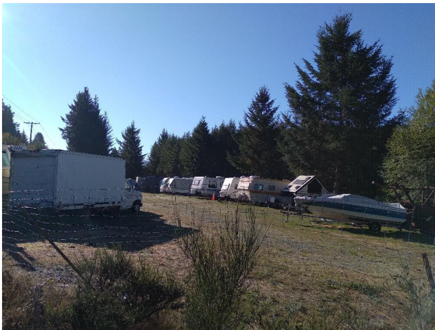
Figure 10 Existing business, taken from new area