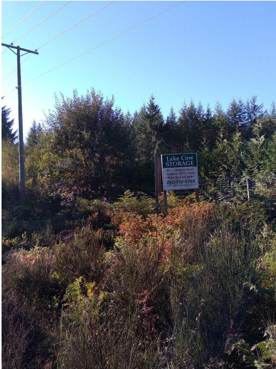
Figure 11 Close up of existing sign