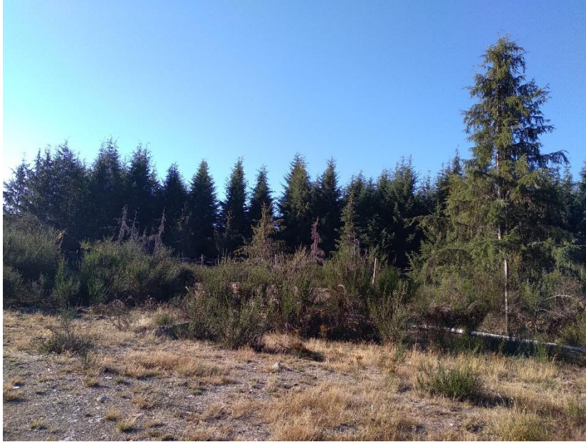
Figure 3 Looking north across Youbou Road