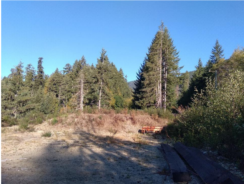
Figure 1 Berm at the NW end of the property