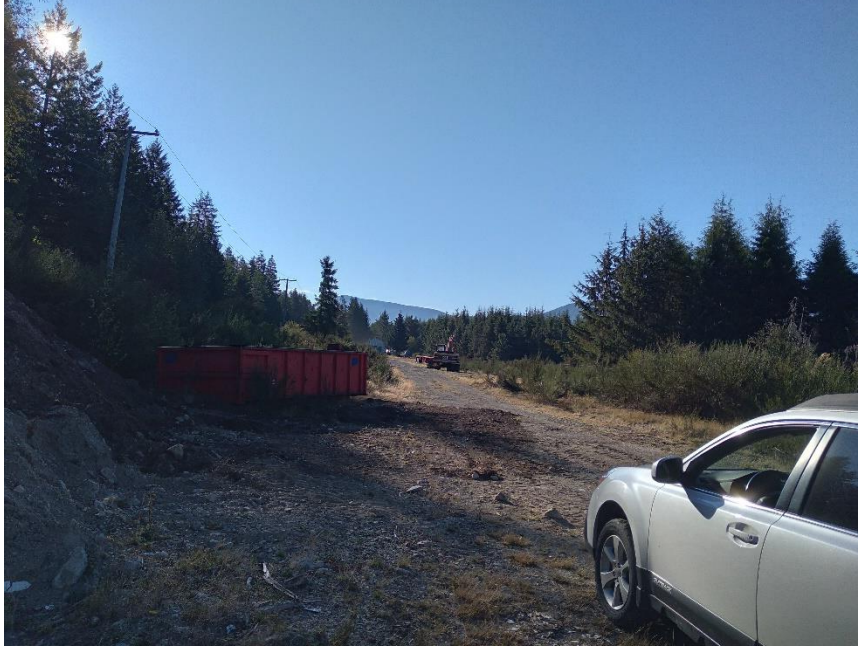
Figure 6 Looking south east towards the gate, from the berm at the northwest end of the property