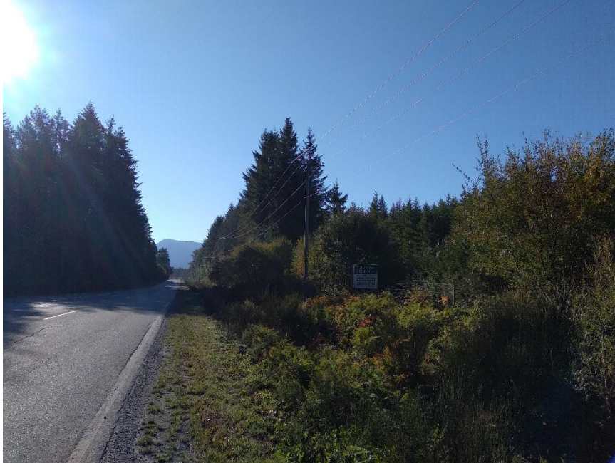
Figure 12 Sign in context along Youbou Road, looking east