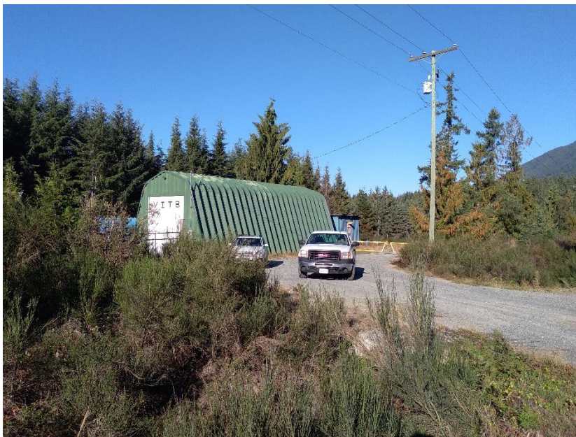
Figure 2 Existing driveway, to be used as main access for extended business