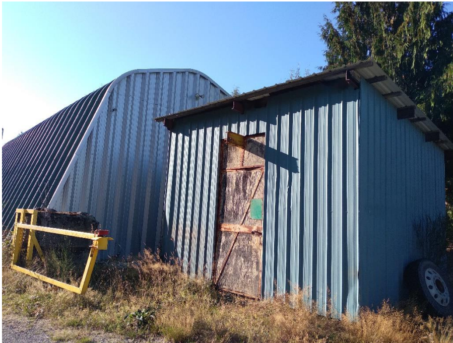
Figure 7 Existing shed on skids, on the new area, adjacent to the gate and the storage on the existing I-4 zoned portion