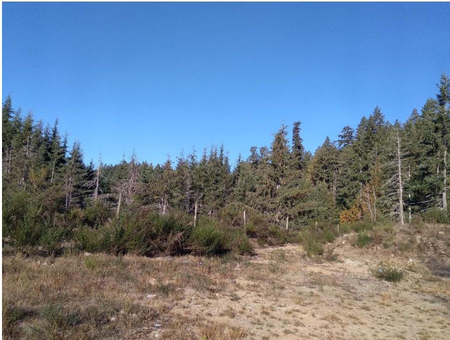
Figure 4 Looking southwest across the fence into the tree farm