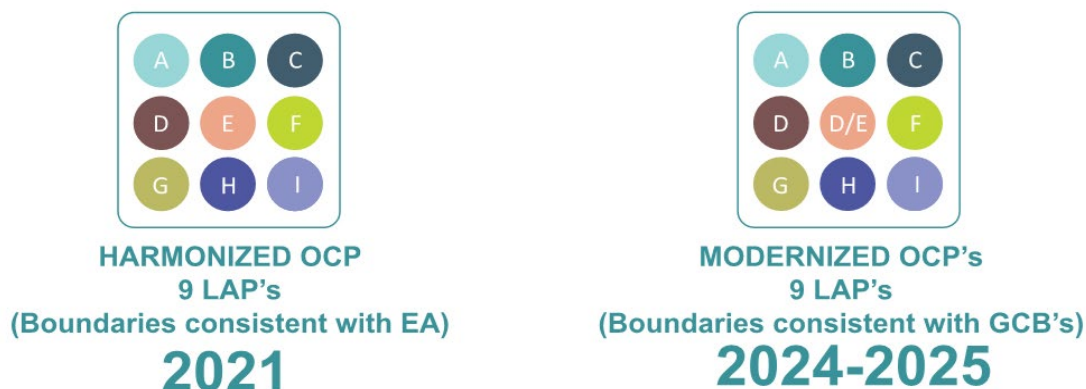
Figure 1 Local Area Plans from Harmonization to Modernization

Local area plans are planning documents that build upon the vision, objectives and policies in the OCP. They provide greater detail on growth management for communities and area-specific objectives and policies to address daily needs, infrastructure, transportation and housing. There are nine local area plans in development in the electoral areas, that are generally aligned with growth containment boundaries. See Figure 1 – Local Area Plans from Harmonization to Modernization.