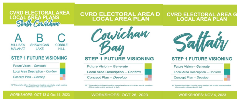
Figure 2 Workshop Booklet Samples (Fall engagement Step 1 Future Visioning)