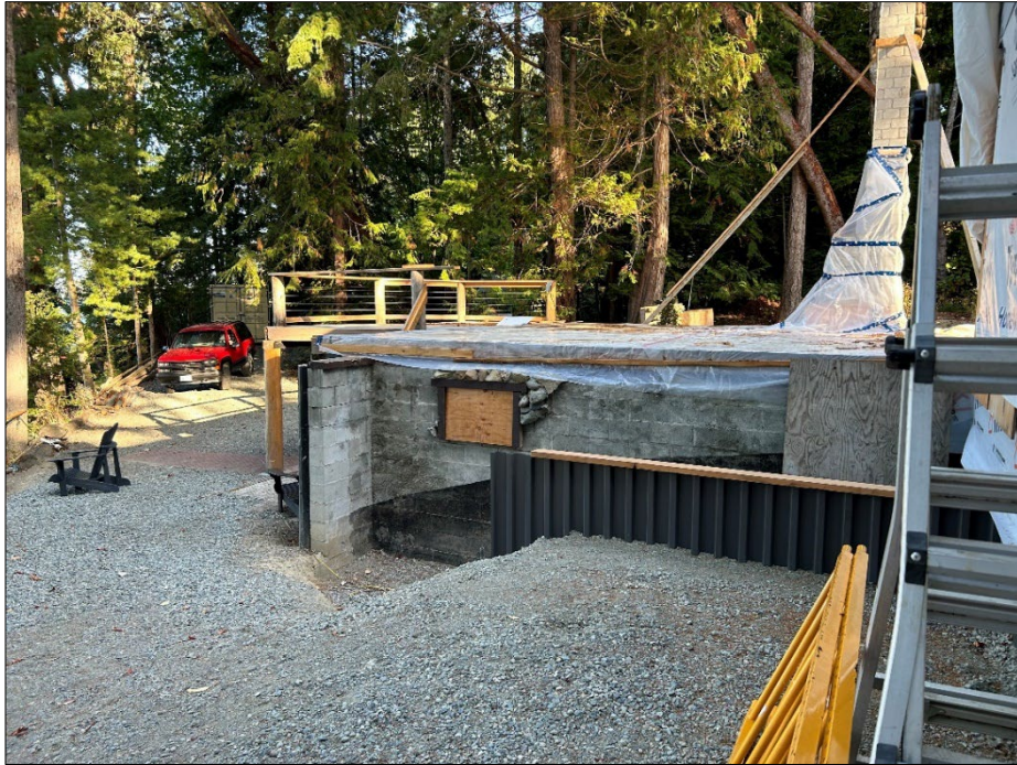
Existing dwelling foundation, corner within 15 m setback from watercourse (sea)