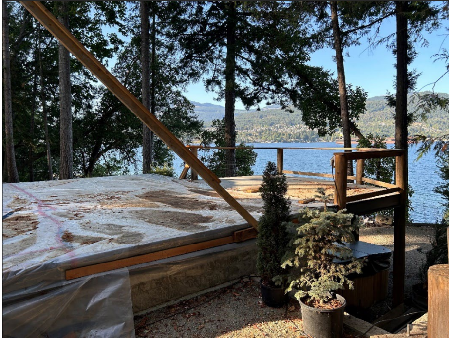
Existing dwelling foundation and deck