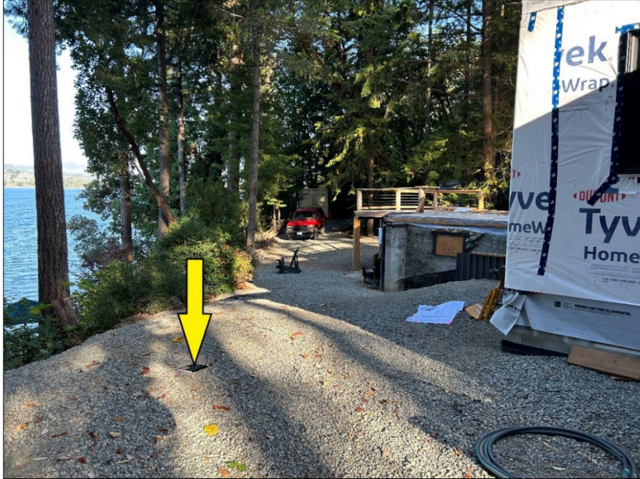
Approximate location of proposed deck (post)