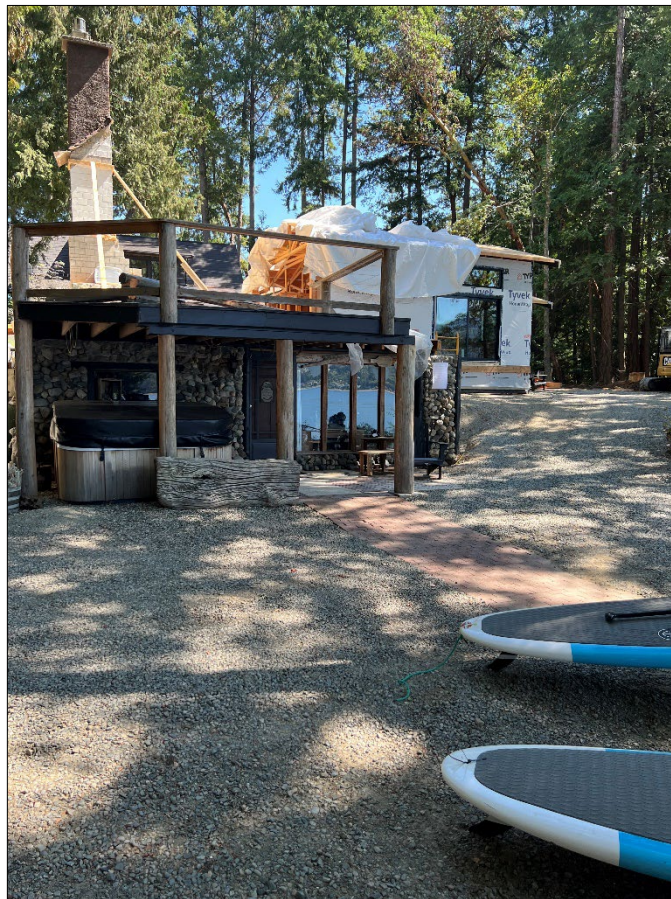
Existing dwelling foundation and deck