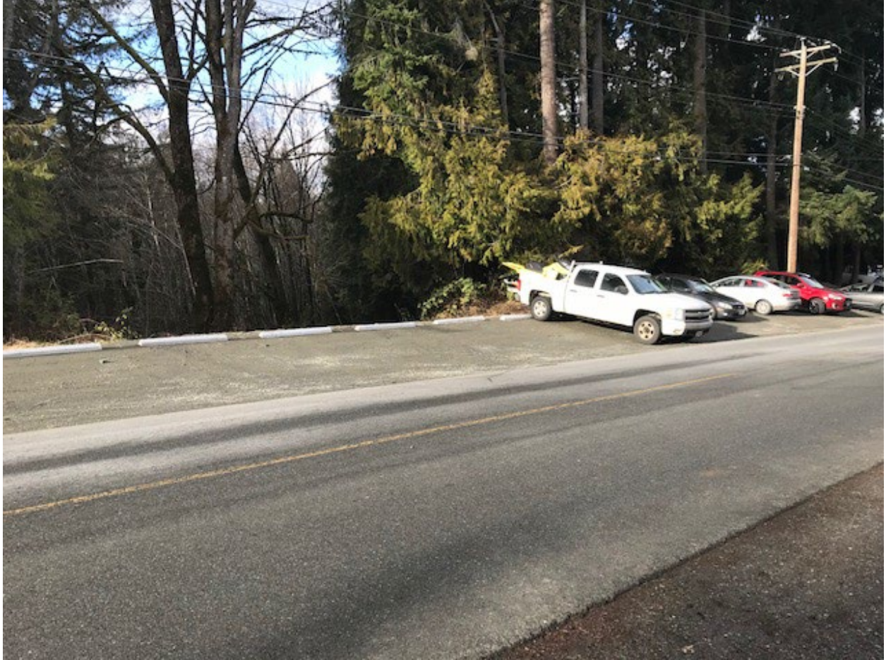
Deloume Road Park and Ride - Completion Photo