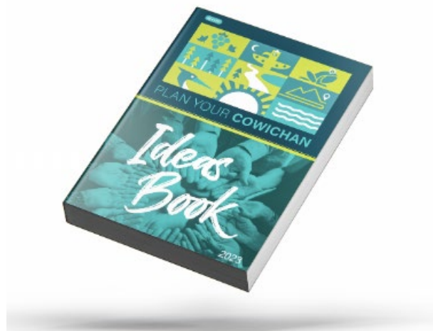
Figure 1 Ideas Book

The Ideas Book was created as a collection of community ideas and has been updated to reflect community comments from the Fall 2023 engagement. The Ideas Book is posted on PlanYourCowichan .