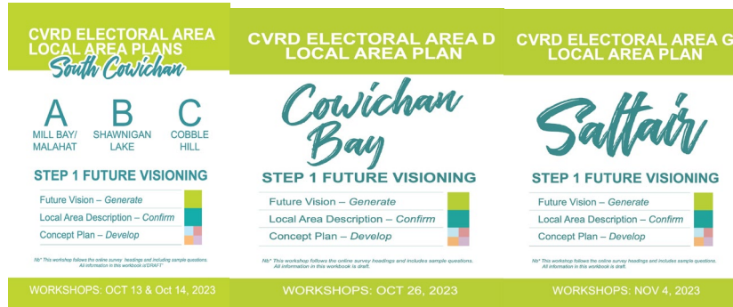
Figure 2 Workshop Booklet Samples (Fall engagement Step 1 Future Visioning)