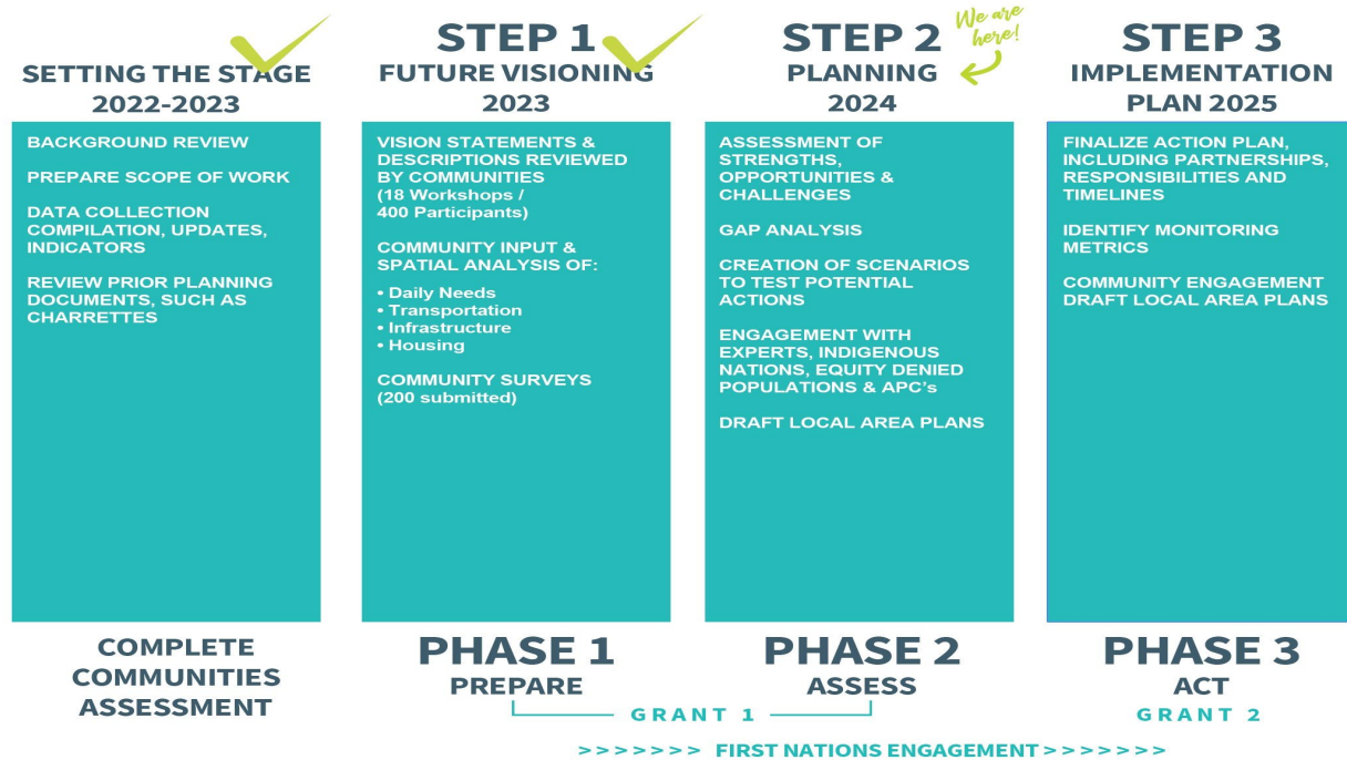
Figure 3 Local Area Plan Steps vs Complete Community Phases

The Complete Communities Assessment Grant #2 would provide detailed analysis that is complementary to the local area planning process to support Step 3 Implementation Plan, which corresponds with Complete Communities Phase 3 Act. In Phase 3 an implementation plan and performance metrics will be developed for each local area plan. See Figure 3: comparison of the local area plan steps vs the complete community phases.